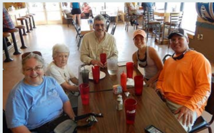
CELEBRATING THE MORNING’S CATCH AT THE LAKESIDE RESTAURANT

level was a few inches above the top of the dam, and the water was light to moderately brown and slightly turbid in the lower lake. The weather was primarily scattered clouds with relatively light winds, a beautiful day. Bluegills had moved off the banks into 3 to 4 feet of water, and were frequently interspersed with a scattering of other species, all of which hit a variety of small jigs on light spinning gear. Karen Anderson and Art Conway released 43 bluegills and 1 shellcracker by 1:30 PM, at which point we repaired to Lakeside Restaurant for lunch. Taylor and Carter Clevinger and Bob Brown joined us for lunch. Taylor and Carter reported they had caught a mix of nice bluegills and crappies from their kayaks, with one of Taylor’s bluegills measuring 10+ inches and weighing slightly over 1 pound for a state citation by weight. Bob reported a mixed bag of numerous bluegills, one pickerel, and several bass. We had a really fun day and plan to reassemble the crew to do it again as soon as schedules permit.