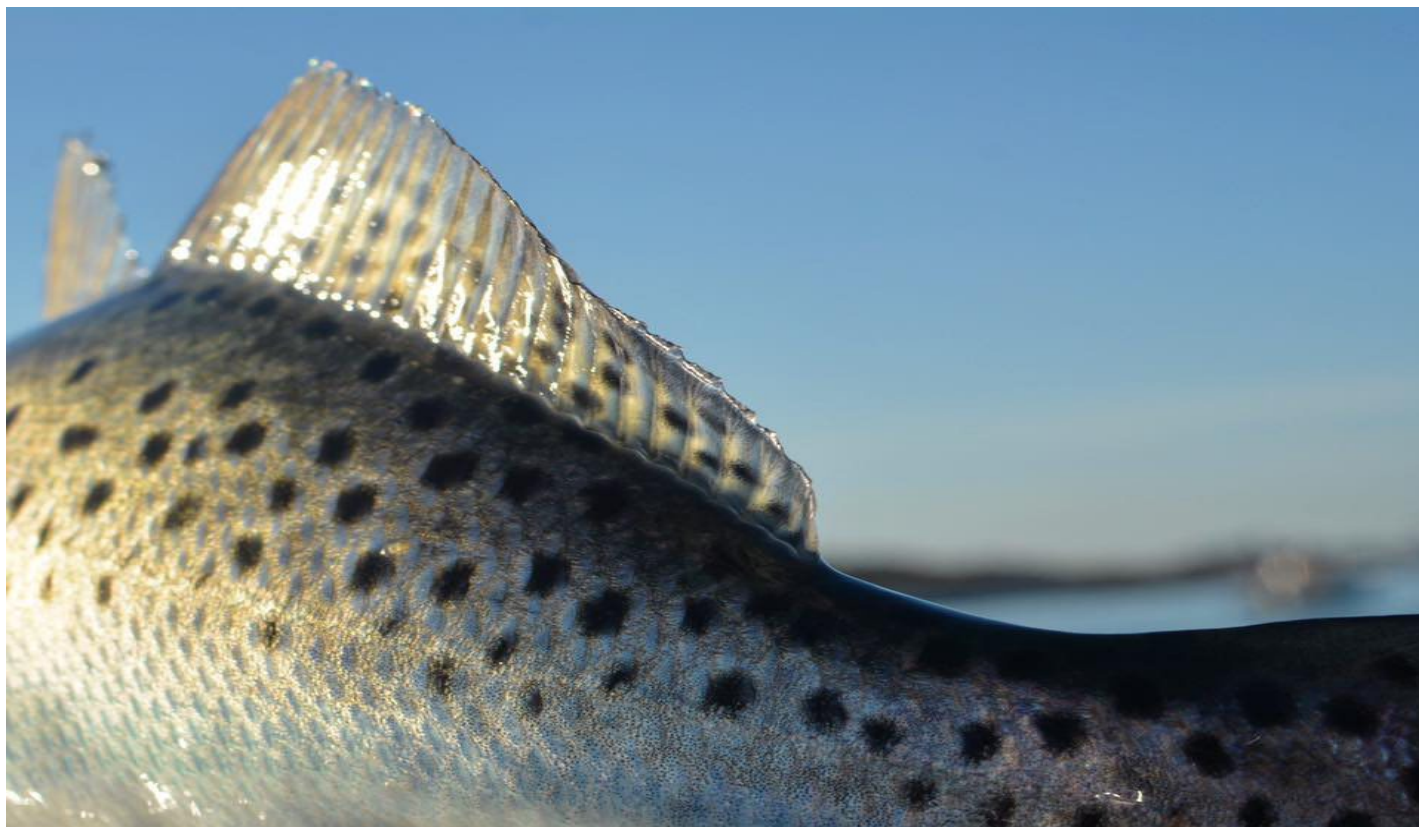
Spotted Sea Trout