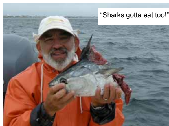
"Sharks gotta eat too!"