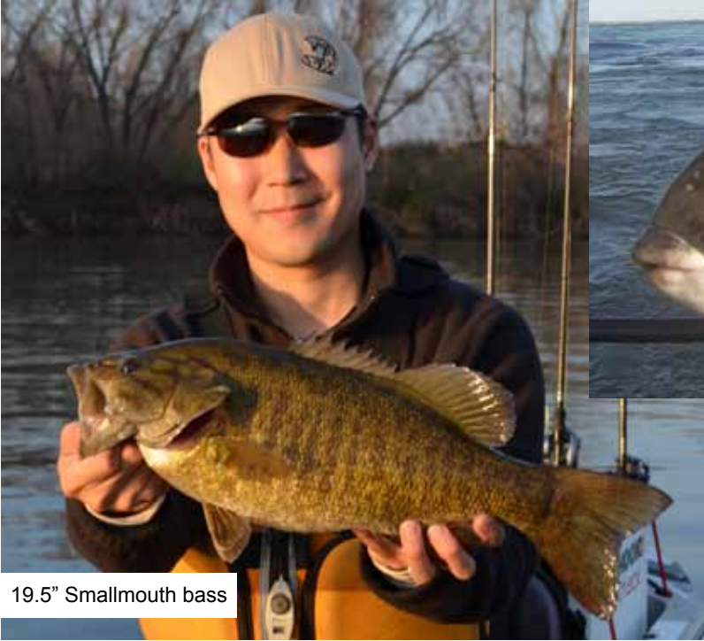
19.5" Smallmouth bass