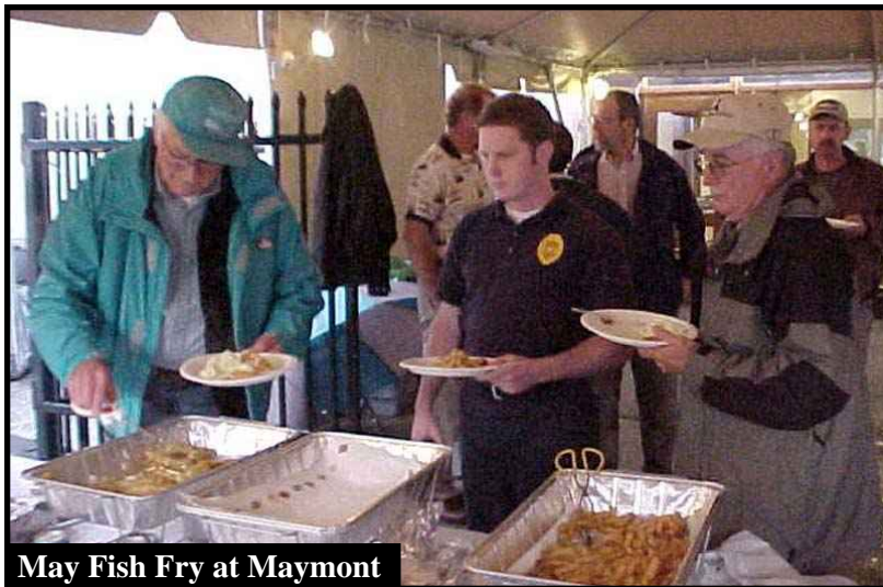
May Fish Fry at Maymont