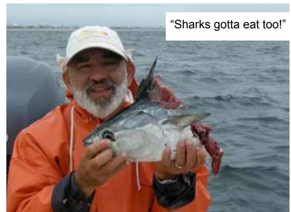
"Sharks gotta eat too!"