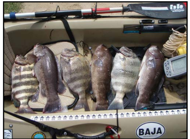
Kayak full of Sheeps n Togs